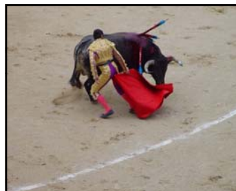
Bullfight in Madrid

We spent 8 days in Spain the middle of May with our son-in-law and daughter. The highlights of the trip for me were the Bullfight in Madrid and the Sagrada Familia designed by Gaudi in Barcelona. Soon I will be posting some of our photos from Spain on: www.liftingburdens.org