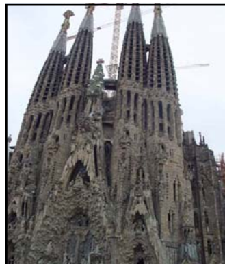
Gaudi's Sagrada Familia